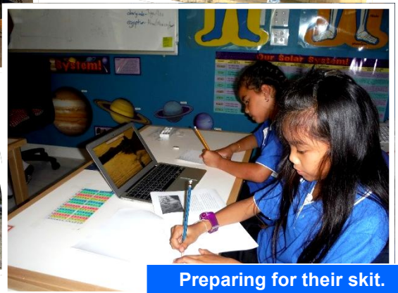
Preparing for their skit.