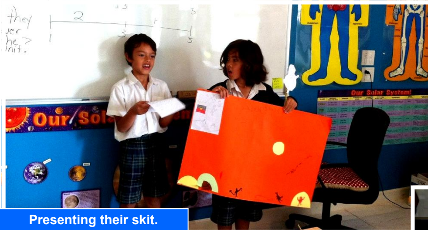
Presenting their skit.

Year 3 and Year 4 are wrapping up their unit with a nice skit or puppet show. Students are compiling their information about different cultures on the planet and talking about how the physical geography of the Earth has impacted their lives. Students presented the information before the end of the half term.