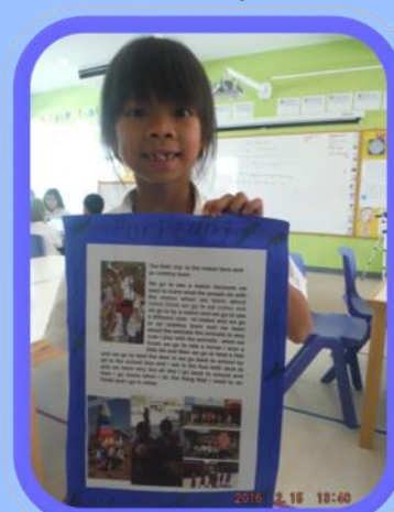
My recount of our Field Trip