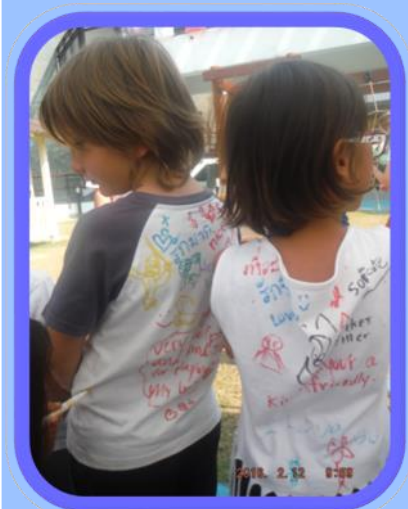
Valentine's Day signing of shirts

We have new started a new Unit of Inquiry this half-term. The theme is "How the World Works" and the Central Idea is, "the design of buildings and structures is dependent upon environmental factors, human ingenuity, and available materials." We are currently in the process of designing and building a garden area at the rear of the school which I will use throughout the unit for students to discuss our Central Idea and watch as the garden develops from start to finish.