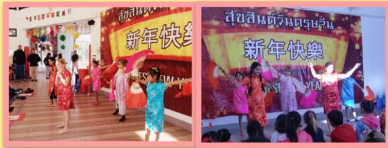
I love Chinese dance !

Lion Dancing, Dragon Parade, Red Lanterns, Cheongsam, paste down the door- gods endless banging sounds from the firecrackers..... Did you enjoy our Chinese New Year? How much lucky money did you get from your parents and friends? Did you pay a New Year call to your parents and grandparents. Chinese New Year is a relaxing and leisurely holiday for all to enjoy. It was great to see our students enjoying themselves at our Chinese New Year festival at UDIS.