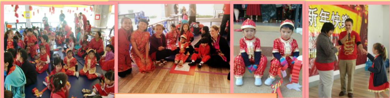
I got lucky money , All in the Family !