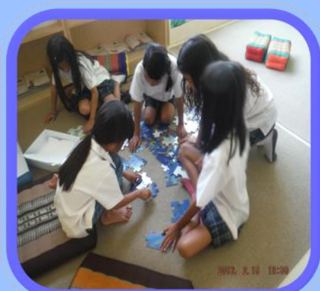
Working Together to solve a problem

At the end of last half-term, the Year 3/4 class participated in our school Valentine's day celebration. We have been learning how to be kind and caring towards each other, which was a focus on the day including bucket filling and sharing kind thoughts. We also had a signing session where students got to write a thoughtful or caring message on each other's shirt. We also participated in our school Chinese New Year and Sport day, with the Black Team taking out the honours. Very successful Days with fun had by all.