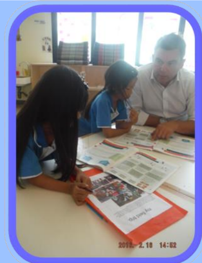
Working with one of math groups

Welcome back to Part two of Term two. We are finishing up our last Unit of Inquiry - How we organise ourselves. The central idea being "People create organizations to solve problems and support human endeavour and enterprise." We visited Udon Thani Melon farm and PC Cowboy Ranch for the students to display their understanding of the Unit and the Central Idea. The students completed a recount of the trip and wrote a reflection about why we went on the trip and how it related to our topic. They also produced a Powerpoint showing their understanding of our topic. They will be included in the students portfolios where then can share what they have learnt with the parents at Student Led Conferences near the end of term.