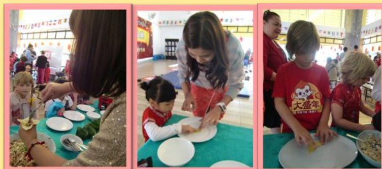
We made delicious dumplings !