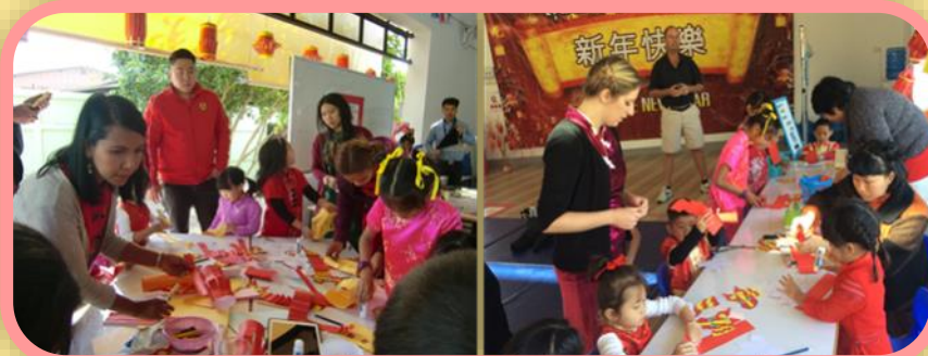
I can make a Chinese lantern & dragon!