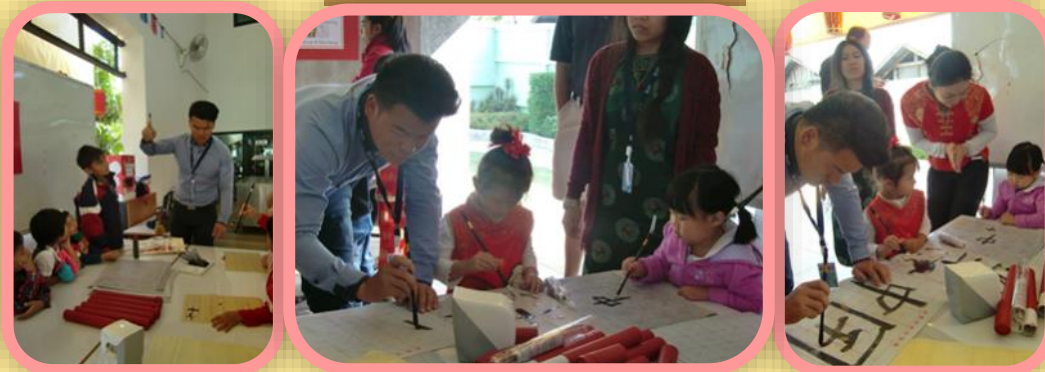
I can Chinese calligraphy !