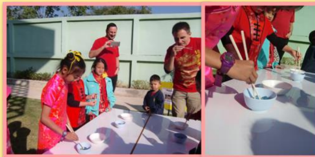
We know how to use chopsticks !