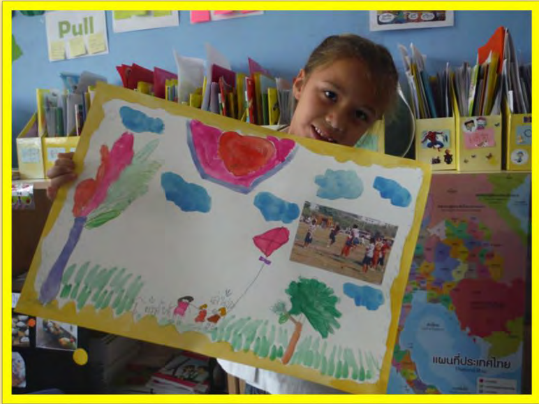
Thai Games : UOI Recycling and Thai Unit: Thai toys