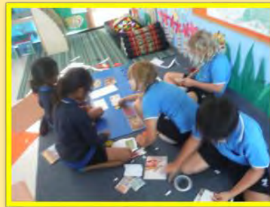
We learn and share