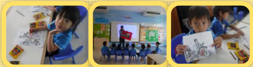
K2 students learning about traditional Chinese stories.