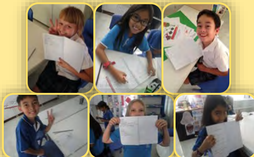
Year 5 students learning about Chinese writing skills and developing their Chinese speaking skills .