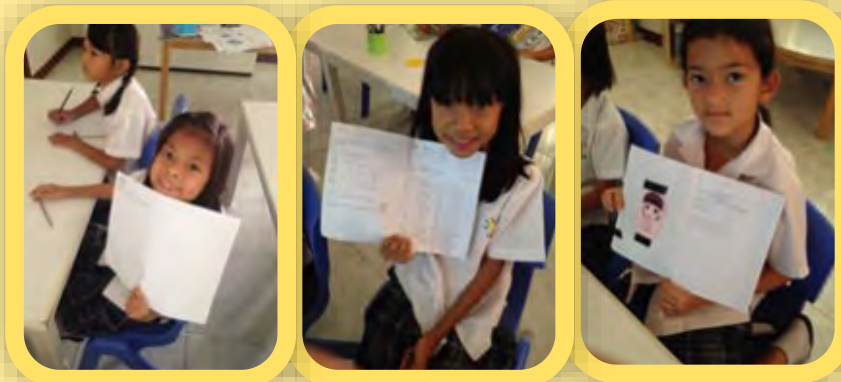
Year 3/4 students learning about reading and writing.