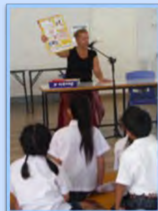
Our Social Story