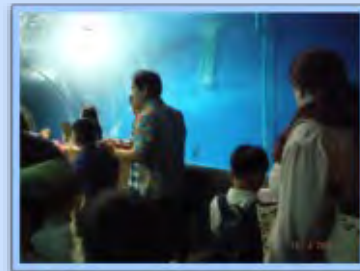
Year 1 & 2 Field Trip to Aquarium

This term has seen some great developments for all the students in Year 1 regarding their mathematics and English skills. Students have demonstrated great strength in one or more areas, which they cannot wait to share with parents at their student conferences. A range of pictures have been selected from their many moments on Story Park, which have been placed in a video for which they have chosen their own soundtrack. They have reflected on how they have demonstrated the positives of the IB Learner Profile by creating a book. In the book they comment on how they feel they have demonstrated each profile and have added photos to create their own individual version of what the learner profile means to them. This will help students gain a better understanding of the profile, which they can then pass on to their parents at conference time.