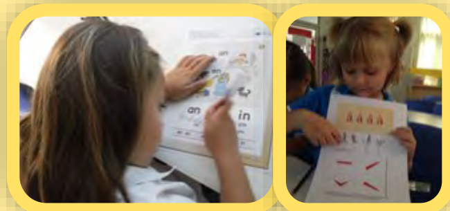
Y1 students learning about Chinese phonics and tones.