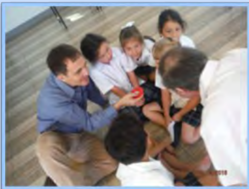
Year 1 Assembly - Speaking & Listening - Learning about languages and cultures

A further time for reflection was had when we created our class social story. This is now complete and we were able to share it with the primary students as part of our assembly on speaking and listening. A fantastic piece of work from a class of students who, on my own reflection, are "Just Plain Awesome!"