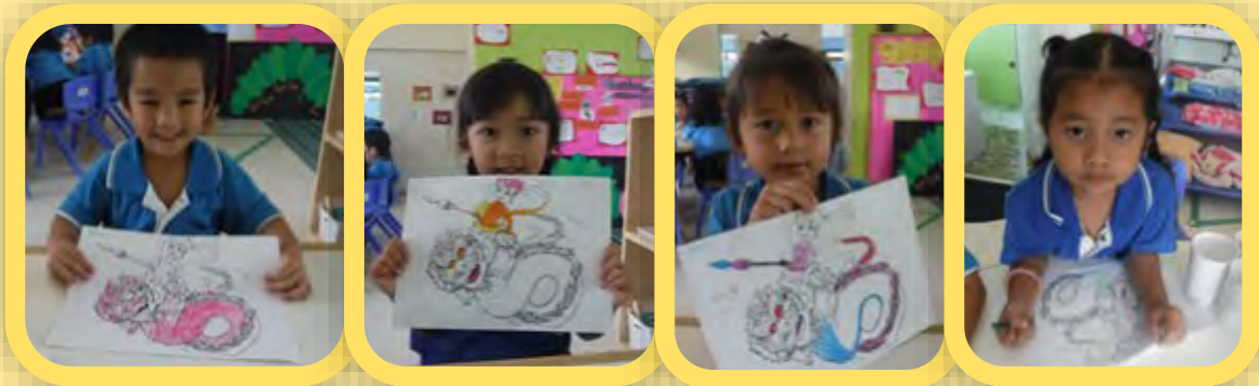
K1 students learning about traditional Chinese stories.

Students have enjoyed the Chinese lessons and have had fun inquiring into different elements of Chinese culture.