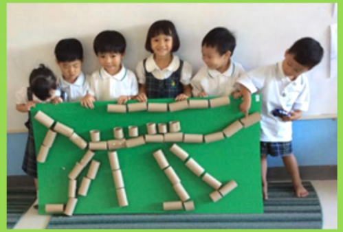
Look at our dinosaur! Rrrr!