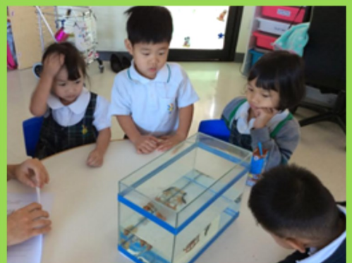
Wondering about the fighting fish