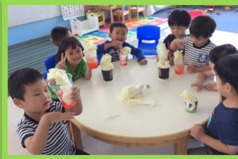
Ton: "What will happen if we add oil inside the cup?" (in Thai)

We also had lots of fun learning size and positional language through movement games and building towers of cardboard boxes. The students enjoyed the group activity 'Spot the letter and circle it!' during which most of the children showed their developing ability to take turns and respect others.