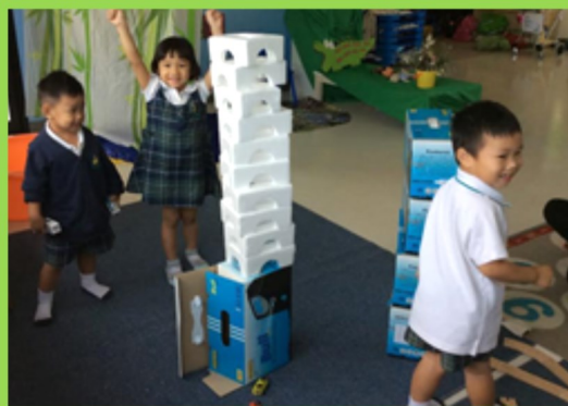
Junior/Majin: "Yes! We did it! This is big and this is small." Euro: "Oh, it is beautiful!"