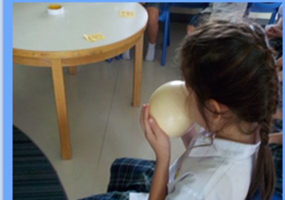
Close observation was important!

In great style Year 4 were effective Risk Takers observing very carefully and suggesting what the object might be. They were super Inquirers thinking of appropriate questions and lines of inquiry to follow. A very scientific approach was adopted and the students reached the correct solution after much discussion and investigation. Our mystery object turned out to be an ostrich egg from Africa.