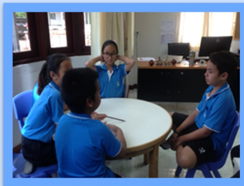
Let's put our thoughts together.....