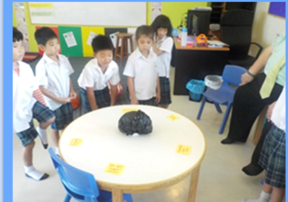
What might be inside the bag?