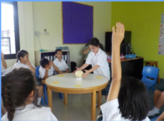
Fragile handle with care!