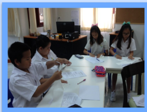
Pride in our work!!!!