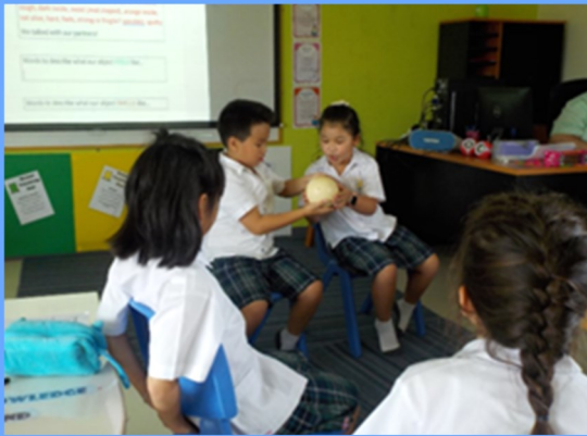
Passing the object around our circle.

Year 4 have solved a huge mystery by using their, observational, thinking, scientific, mathematical and detective skills. We had a mystery object in class. Could the children work out what it was?