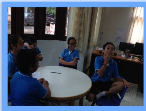
Asking questions.. We are researching..