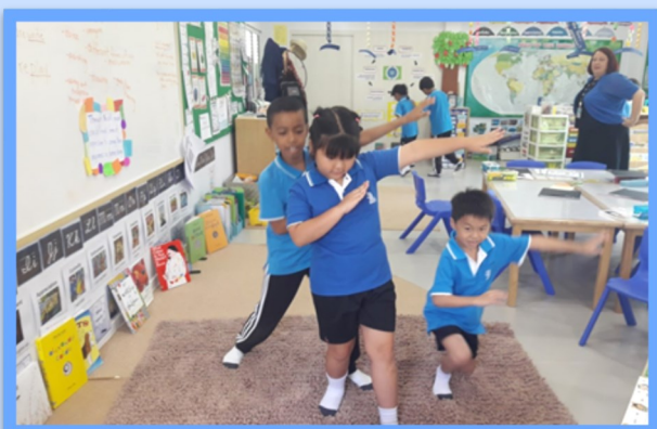
Learning mixed media techniques.