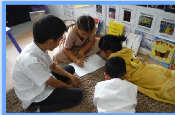
Writing their own play.