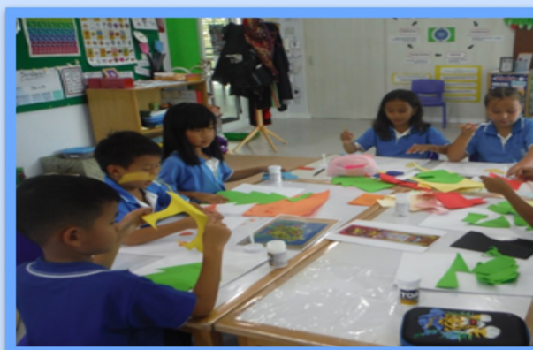
Exploring dances from around the world.