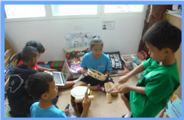
Composing a song together.

What are the arts? You might ask. The Arts can include dance, performing arts, drawing and painting to just name a few. Year 3 class has surrounded ourselves with the arts! All the different ways we can express our thoughts and feelings, while fostering questions and creating art, have helped students learn about themselves and build their confidence.