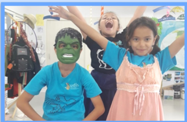
Performing their dance act.